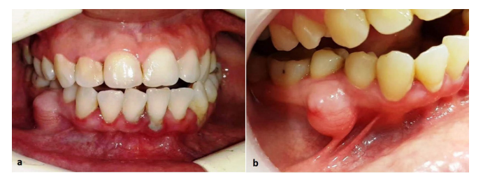
Figure 1a, b. Pre-operative intra-oral clinical view of the lesion.

In intra-oral examination, a bony hard and non-tender mass with intact overlying mucosa on buccal and lingual aspects of mandibular right premolars was observed (Figure 1a and b). The associated teeth were non-vital and mandibular right second premolar was mobile.