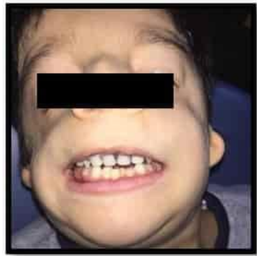
Figure 3. Frontal view of the partial denture

Acrylic denture teeth (TriadTruTray, Dentsply International) were used for proper lip support and proper plane of occlusion in the partial denture (Figure 3). The GA procedures as entubation, administration of anesthetic drugs and post-operative complications were managed with high-risk patient profile.