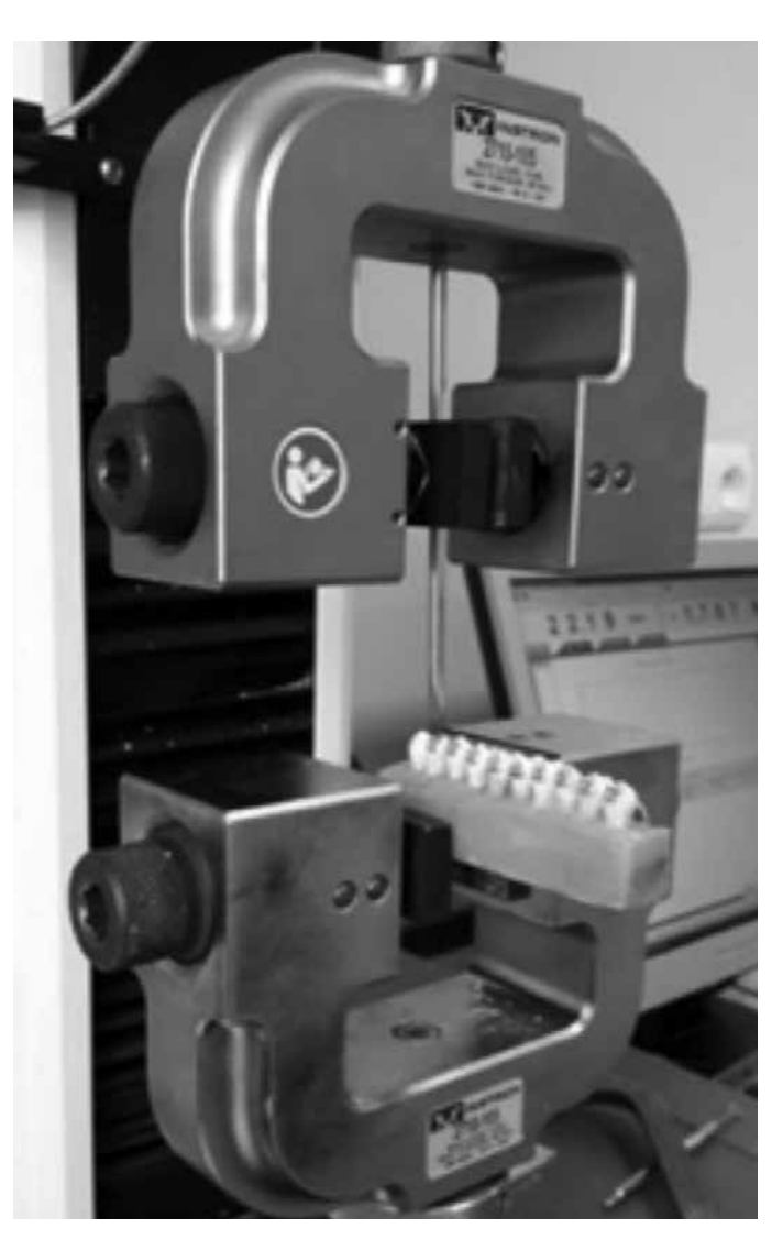
Figure 2. Test apparatus used for shear bond strength testing.