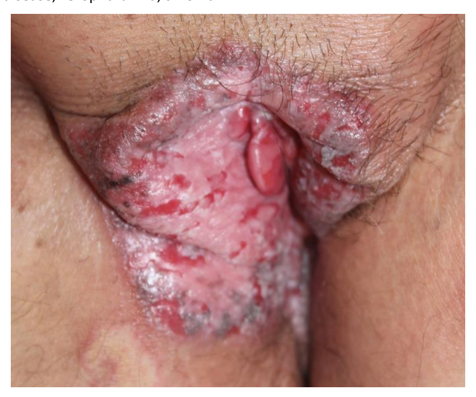
Figure 1 . White hyperkeratotic plaque with small superficial erosions and hyperpigmentated areas on the right inguinal region, bilateral labium minors, majors and clitoris

Dermatological examination revealed white hyperkeratotic plaque with small superficial erosions and hyperpigmentated areas on the right inguinal region, bilateral labium minors, majors and clitoris (Figure 1).