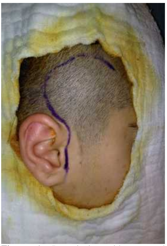
Figure 1. Preauricular with temporal extension flap design.

exercises. Patients were followed weekly at first month and 3rd, 6th, 12th, and 24th month postoperatively. Patients were evaluated in terms of maximum interincisal opening and occlusal stability in each appointment.