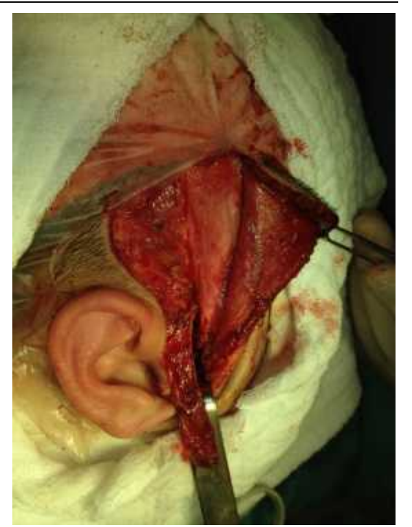
Figure 3. Transpositioning of the temporalismyofascial flap.