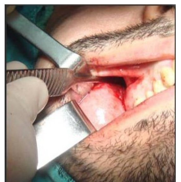
Figure 3. The intraoral dissection and drainage were performed along the tuber of the maxilla.

for one week period. Patient also used muscle relaxants for two weeks.