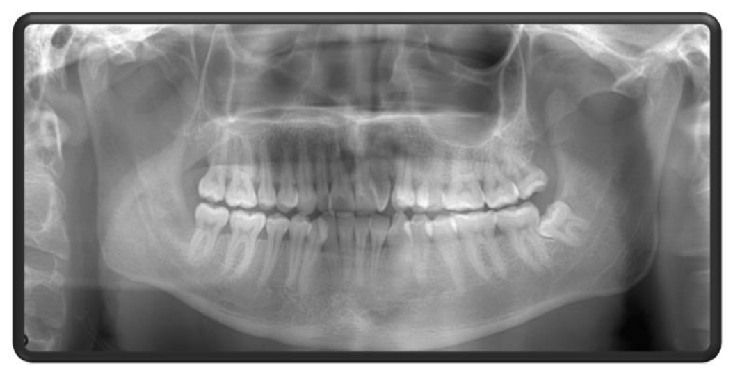
Figure 1. The extraction socket of the upper right third molar can be detected on the panoramic radiograph.