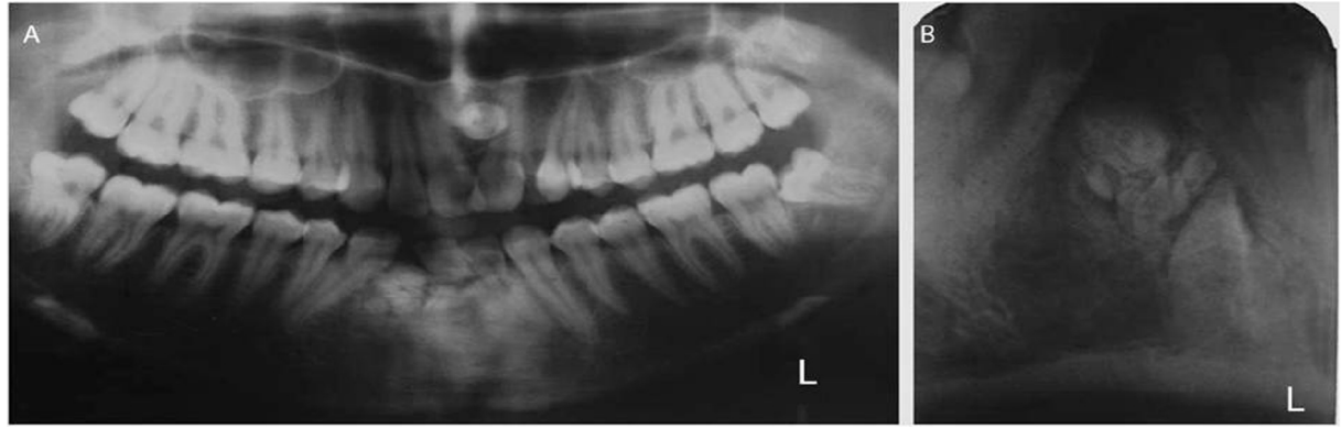
Fig 1. A: Initial Panoramic radiograph.

when she was 4 years old. A right mandibular central incisor in the vertical position and covered with multiple radioopaque structures was determined to be present through panoramic and periapical radiographs (Figure 1) and extracted in a surgical operation. It was established that central incisor the had manv tooth-like structures after the surgical operation (Figure 2). The initial radiographic diagnosis was a compound odontoma, and it was also confirmed histopathologically (Figure 3). The patient was advised to come to our clinic if any complication occurred, such as pain or swelling.