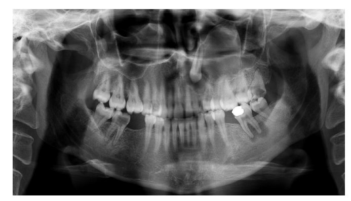
Figure 1: Preoperative orthopantomograph

Panoramic radiograph showed a well defined unilocular radiolucency surrounding canine teeth in the left premolary region of the maxilla. Displacement of the root of the maxillary left lateral teeth was also seen. (Fig. 1)