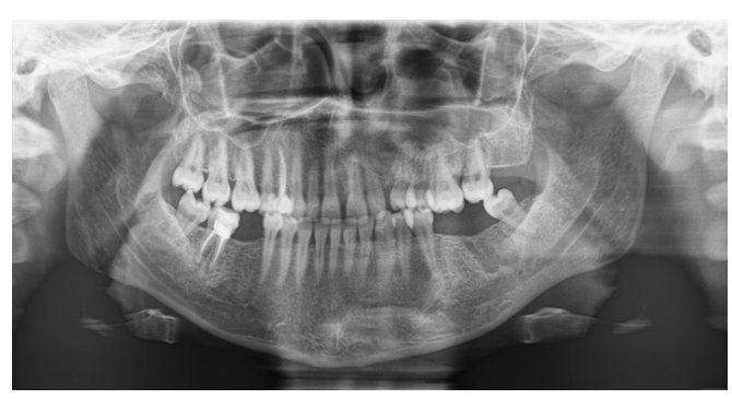
Figure 2: Postoperative orthopantomograph (6 mouth)

The diagnosis of dentigerous cyst was confirmed with clinic, radiographic and histopathologic findings. Dentigerous cyst histopathology shows a thicker epithelium lining with hyperplastic rete ridges. The fibrous cyst capsule showed a diffuse chronic inflammatory infiltrate. (Fig.3) DC was enucleated and the associated impacted teeth extracted under local anesthesia. The patient tolerated the procedure well. Sutures were removed on the eight day after operation and the postoperative course was uneventful. Post-operative clinical follow-up that was conducted after one and six month of the surgery was uneventful. (Fig.2)