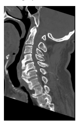
Fig. 1. Sagittal view of computed tomograpy (Degenerative changes in the cervical spine)

the physical examination of the patient, there was abrasion in the left frontal region and left cheek, and swelling around the left eye. Although the sensory examination of the patient was normal, he was tetraplegic. No acute pathological finding was detected in the brain and cervical CT imaging of the patient. Because the patient was tetraplegic, cranial MR and cervical MR imaging were performed. While acute pathology was not detected in the cranial MRI of the patient, posterior disc herniation at the C3-4 level secondary to trauma was detected in the cervical MRI. The patient was consulted with neurosurgery and emergency surgery was planned and the patient was taken into surgery.