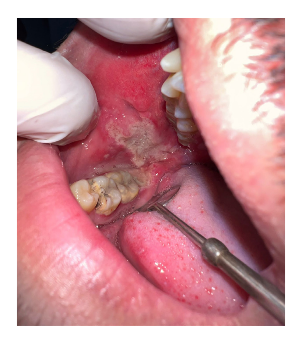
Figure 1: Patient's intraoral examination; along with the halitosis and limited jaw movements, an erythematous area covered with fibrin was observed on retromolar area.

A 22-year-old male patient presented at the Department of Oral and maxillofacial Radiology at Marmara University Faculty of Dentistry with complaints of difficulty in swallowing and pain around the right retromolar region. He also had halitosis, pain in the oropharynx and lymphadenopathy in submandibular lymph nodes. Patient had a poor plaque control without any parafunction and had no other significant medical history or known allergies. He was smoking a pack of cigarettes a day. Intraoral examination showed erythematous, ulcers with irregular margins and grayish-white fibrin in the soft tissue of the right retromolar region of the mandible and in the buccal mucosa (Fig. 1). Panoramic radiography image revealed the partially impacted third molar existence in both sides and multiple caries caused by poor oral hygiene (Fig. 2). In the treatment of infected tissues, systemic antibiotics and hydrogen peroxide mouthwash were applied for 6-7 days and extraction of the third mandibular molar tooth was recommended. In this case, the patient was referred to us due to his acute condition and he went to another clinic out of the city for dental treatment. After 1 week of antibiotic and mouthwash use, improvement was observed in the related lesion (Fig. 3).