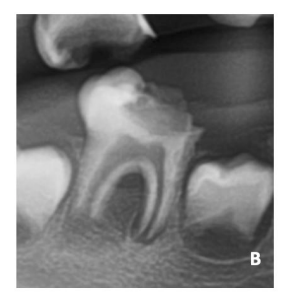
Figure 1A-B: intraoral and radiographic image of the right mandibular first molar before treatment.

After the placement of a rubber dam (Royal Shield Dental Dams, MALAYSIA) on the tooth, no anesthesia was administered in the treatment, since the tooth appeared to be necrotic. However, after reaching the pulp cavity, the patient was observed to feel pain and mandibular block anesthesia was administered with Ultracain DS® (Sanofi-Aventis, Frankfurt Main, Germany). Bleeding without dark color was observed in the pulp cavity and it was determined that this bleeding originated from the pulp in the mesial canals. Based on this finding, it is possible to assume that the pulp tissue in the mesial canals may still be vital. Bleeding was controlled within 3-5 minutes through 2.5% NaOCl after removal of the pulp, which was thought to be inflamed, in the coronal of the mesial canals. (Fig. 2A) The vital pulp tissue left in the mesial roots was covered with Biodentine® (Septodont, France) and glass ionomer cement (EQUIA Forte Fil, GC America) was applied on it.(Fig. 2B-C)