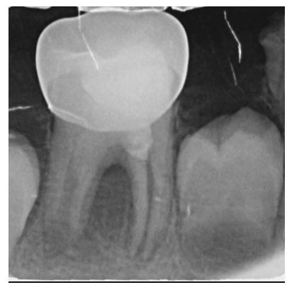
Figure 3: Radiograph taken after completion of treatment

In the following 2 weeks, the patient's symptoms disappeared and the red and swollen gingiva in the buccal region healed. After the tooth was anesthetized with 2% mepivacaine (Citanest; AstraZeneca, London, UK) without vasoconstrictor, the procedure was initiated under a rubber dam. In this session, the distal root was irrigated with 20 ml of saline followed by 20 ml of EDTA. After the canal was dried, intra-bleeding was provoked by extending 2-3 mm beyond the apical region using a 15 Hfile. After it was observed that the bleeding reached the coronal part of the root, it was covered with Biodentine. In order to prevent fractures and post-restoration microleakage, the tooth with significant material loss was restored with a stainless steel crown (3M ESPE) (Fig. 3).