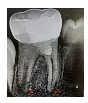
Figure 4: Radiographic images taken 9 months (A) and (B) 1.5 years after treatment

Although the patient did not respond to the cold test and electric pulp test applied to tooth number 46 in the follow-ups at the 9<sup>th</sup> months and 1,5<sup>th</sup> years, no clinical and radiographic symptoms were observed.