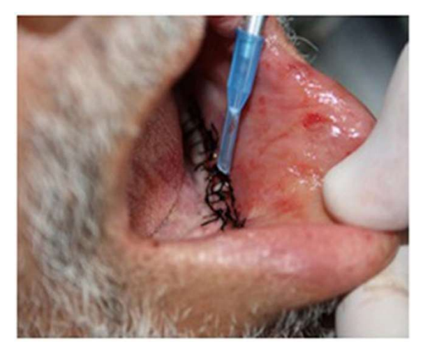
Figure 3- Ozone application

The ozone gas was applied locally to the site of surgery, every day for one week after the operation. Ozone gas was applied approximately 1 mm distance from flap by a machine (W&H Prozone Bürmoos, Austria) and tips (Coro Tip). The application was performed according to manufacturer recommends following introduction; 18 second, with program 18 "protocol, total 2.5 min. (Figure 3).