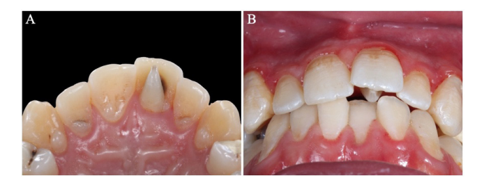
Figure 1. A) Well-defined, large, conical-shaped TC extending from the CEJ to 0.5 mm of the incisal edge on the palatal surface of the maxillary left central incisor. B) Mild anterior crowding caused by bodily labial displacement of left maxillary central incisor and the lingual displacement of the tooth in the opposite arch.

Intra-oral examination revealed poor oral hygiene, gingivitis, multiple white spot lesions, and carious teeth. In addition, an accessory cusp on the palatal surface of the maxillary left central incisor was observed and diagnosed as TC. The well-defined, large, conical-shaped TC extending from the CEJ to 0.5 mm of the incisal edge on the palatal surface of the affected tooth was diagnosed as Type 1 (talon) considering the classification of Hattab et al. (1996). The taloned tooth with normal response to electrical pulp testing had a deep, prominent developmental groove with plaque accumulation as well as a carious lesion (Figure 1A). Bodily labial displacement of left maxillary central incisor and lingual displacement of the left mandibular central incisor in the opposite arch caused a mild crowding in the anterior region (Fig 1B).