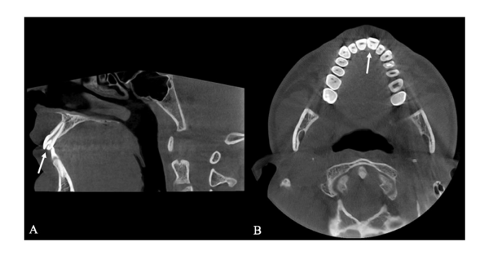
Figure 3. Sagittal (A) and axial (B) CBCT images of the taloned tooth showing the extension of the pulp.

The patient was referred to the Restorative Dentistry Department with the diagnosis of TC, and the measurements of the enamel-dentin thickness were provided to the clinicians for consideration in case of pulpal exposure during restorative procedures. Considering the pulp extension in the TC, a consensus was reached on the steps of the restorative treatment as follows: