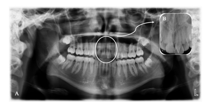
Figure 2. A) Panoramic radiography of the patient with no other pathology. B) Periapical radiograph of taloned tooth in which pulp tissue was not fully visualized.