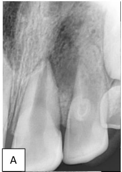
Figure 1 Preoperative (A), 1 month recall

A 9-year-old boy was admitted to the Department of Pediatric Dentistry at XXX University with complaints of swelling and pain. His medical history was not clear. Clinically, the crown of the maxillary left lateral incisor (#10) was without caries. There was swelling of the palatinal region. The type 2 mobile tooth was sensitive to percussion and palpation. Electric (Vitality Scanner; Analytic Technology, Glendora, CA, USA) and thermal (Endo-Ice; The Hygenic Corporation, OH, USA) pulp sensitivity testing was negative only for tooth #10, while the adjacent teeth presented normal responses. There were no pathological periodontal pockets in any of the teeth in the left maxillary region. Radiological examination revealed closed apex Oehlers type II dens invaginatus and severe IRR, as well as apical third of two lateral root perforation and lesion. (Figure 1A).