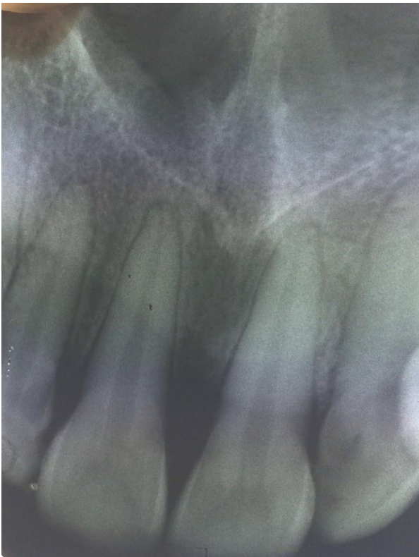
Figure 3: Intra oral periapical radiograph showing bone loss

The mass was surgically excised (Fig 4) with sutures in place under local anaesthesia followed by histopathology investigation.