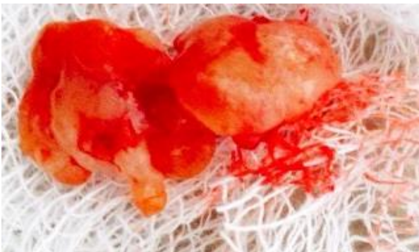
Figure 4: Clinical photograph of the excised lesion

The mass was surgically excised (Fig 4) with sutures in place under local anaesthesia followed by histopathology investigation.