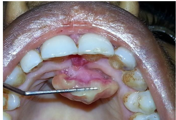
Figure 2: Clinical photograph of the patient showing growth arising from the incisive papilla

On reflection with a periodontal probe, the mass appeared to be pedunculated and attached to the incisive papilla (Fig 2).