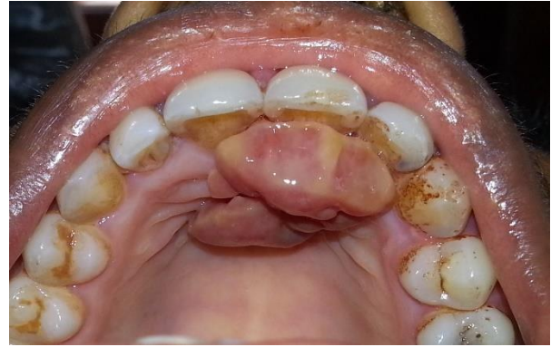
Figure 1: Clinical photograph of the patient showing a growth on the anterior palate

reported by the patient. On general examination no abnormalities were detected. On intra oral examination, well-defined mass reddish pink in colour was noticed in the anterior palatal region posterior to 11 and 21, measuring approximately 3x2 cm in size (Fig 1).