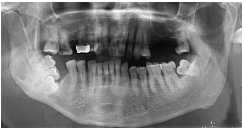
Figure 2. Panoramic radiography of the patient. The presence of impacted three mandibular molars and a morphological alteration of the condyle and coronoid process, at the right side.