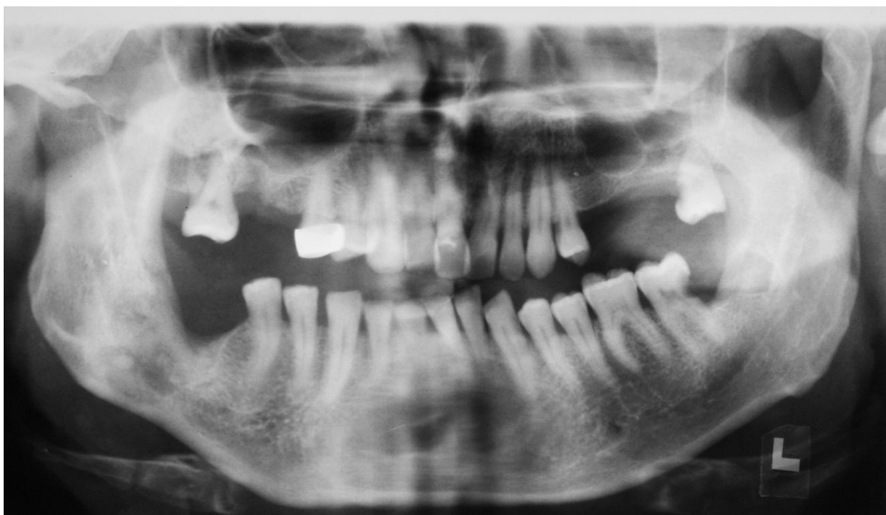
Figure 4. Six months postoperative panoramic radiography of the patient.

Informed consent form was obtained from the patient. Surgical removal of the three impacted teeth were performed under general anesthesia. Reconstruction plate (RP) with 8 holes and 4 monocortical screws was applied after the extraction. Although alveolar neurovascular bundle was visualized and protected in the operation a temporary paresthesia was seen after the operation. However, the patient had return of neurological function 3 months after the surgery. Reconstruction plate was removed 6 months after the surgery and six months radiographic and clinic follow up were satisfactory (Figure 4).