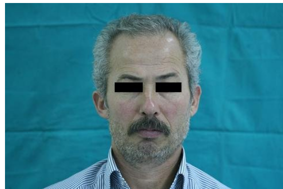
Figure 1. Extraoral view of the patient showing a slight asymmetry of the face.

Intraoral examination revealed the absence of right mandibular first and second molar while the third molar was partially erupted. There was a swelling and ulceration at the overlying mucosa of the molar region. The panoramic radiograph revealed the presence of impacted three mandibular molars and a morphological alteration of the condyle and coronoid process, at the right side (Figure 2).