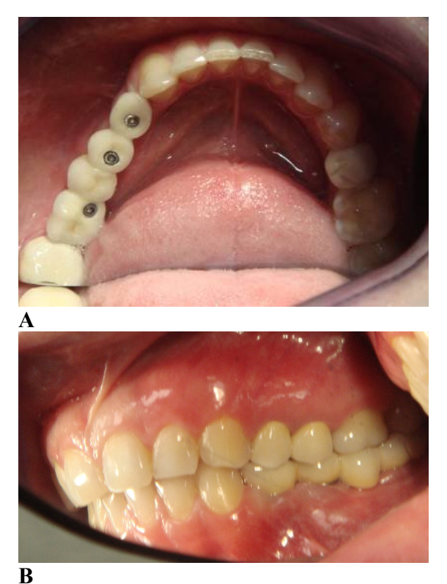
Figure 1A and B. Screw retained restorations used limited interarch.

may be compromised if the access opening is positioned near the facial surface. The problem of retaining screw stability has been addressed by the use of gold alloy screws and torque controlling devices.<sup>4,6</sup> This allowed the development of cemented implant-supported restorations (CISR).<sup>7</sup> CISR have the advantages of simplicity, hermetic sealing of the abutment–crown interface, favourable aesthetics and crown contour, and a single interface between abutment and implant<sup>3,4</sup> (Figures 2A and B).