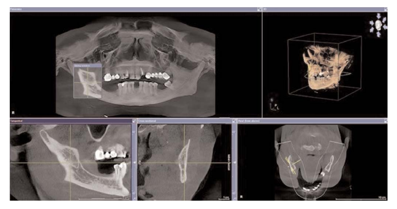
Figure 1. Reconstructed panorama, axial, tangential, cross sectional and 3D images. [Color figure can be viewed in the online issue, which is available at www.anatomy.org.tr]

All CBCT images were evaluated by a single observer. Detected BFCs were controlled by an dentomaxillofacial radiologists who had more than 10 years of experience. Intra-class correlation was calculated for quantitative datas. Cohen's kappa values were calculated for cat-