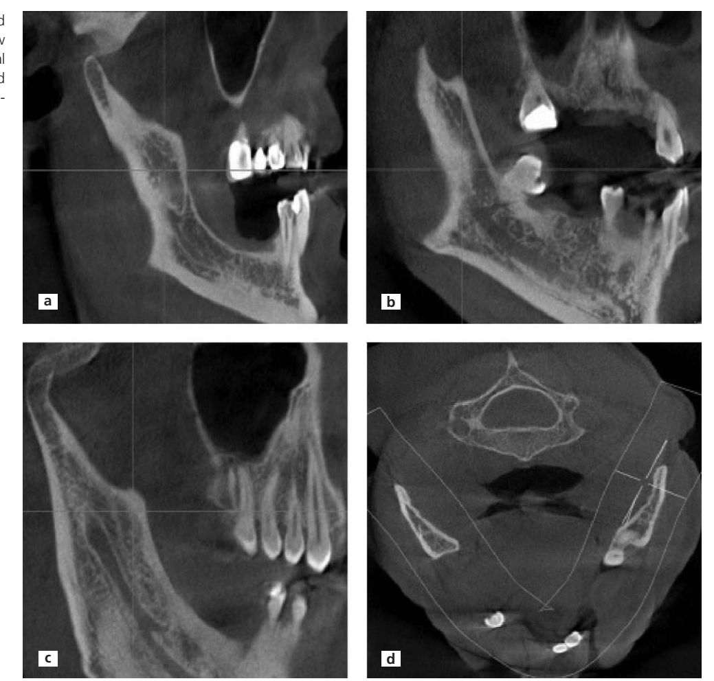
Figure 3. (a) Sagittal view of bifid retromolar canal. (b) Sagittal view of the third molar type dental canal. (c) Sagittal view of forward canal. (d) Axial view of the buccolingual canal.

( Figure 3 ). Forward canals were subdivided into with confluence and without confluence. Dental canals were subdivided into first, second and third molar canals according to the region of seperation from the main canal. Additionally,