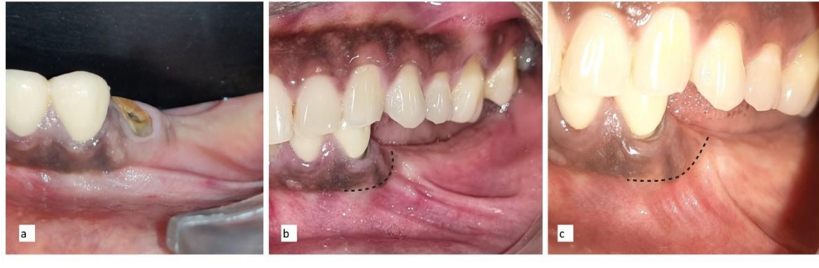
Figure 3: Clinical images showing the increase in the width of the attached gingiva

and 12 months revealed excellent blending and firm attachment of the pigmented tissues with an increase of 2-3 mm in width of the attached gingiva [Figure 3]. No postoperative complications were reported at the surgical site immediately after the surgery and even at 12 months follow-up good healing and plaque control was observed.