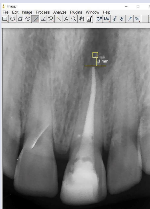
Figure 1: A square-shaped ROI of 30x30 pixels was placed in the geometric center of the apical lesion and 1 mm more apical than the root of the tooth.

T0: Baseline Radiograph; T1: 1 Year Follow-up Radiograph; *p<0.05