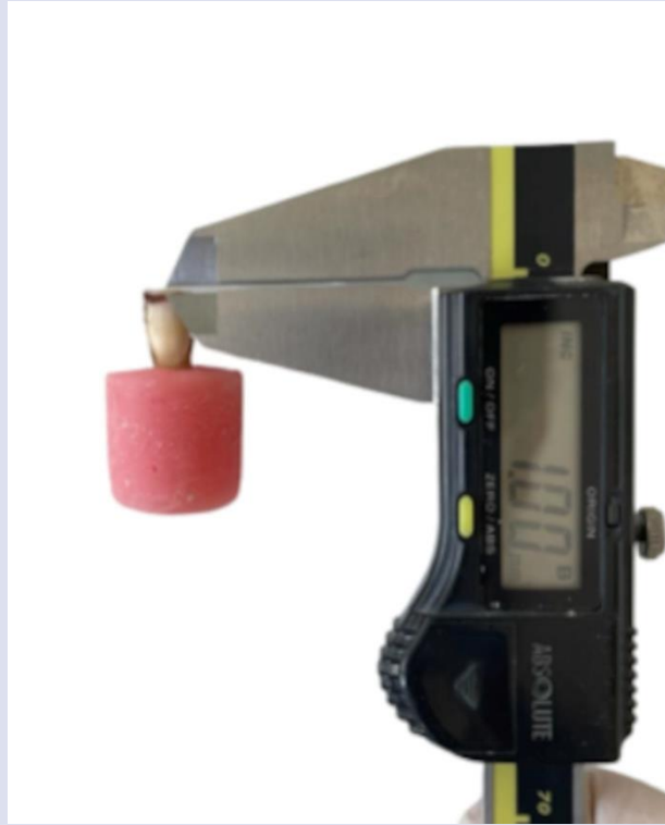
Figure 1. 1 mm of reduction is measured using a Digital caliper.