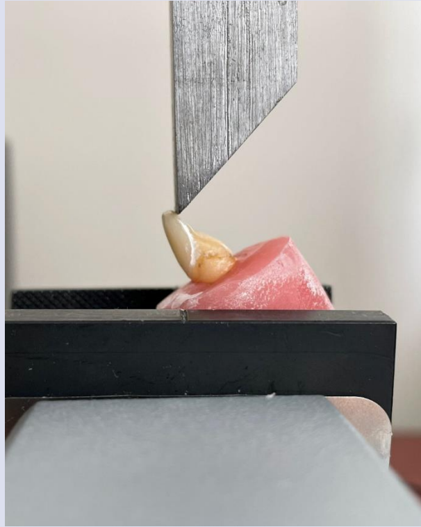
Figure 3. The interface shear bond strength between tooth and restoration was applied.