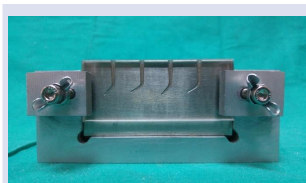
Figure 1. The artificial root canals with the curvature angle and radius of 45°-2 mm, 60°-2 mm, 45°-5 mm and 60°-5 mm, respectively.

Four different artificial canals imitating the size and taper of the files were prepared in a stainless steel block with the curvature angle and radius of 45°-2 mm, 60°-2 mm, 45°-5 mm and 60°-5 mm. The working length was 19 mm and the point of maximum curvature was 7 mm from the apex. The front surface of the artificial canals was covered with a removable glass plate so that the fracture of the file can be seen and the fractured piece can be removed easily (Figure 1).